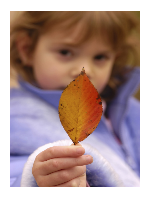
continue the conversations